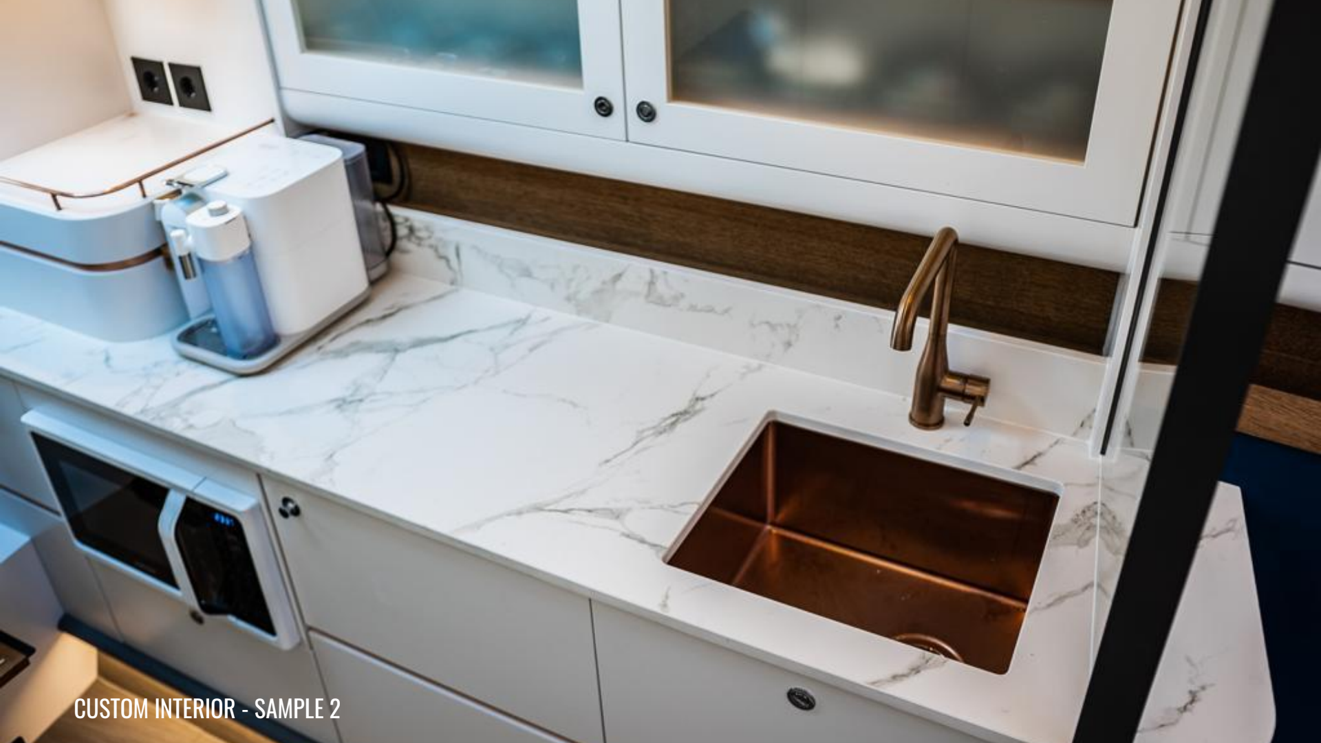
CUSTOM INTERIOR - SAMPLE 2