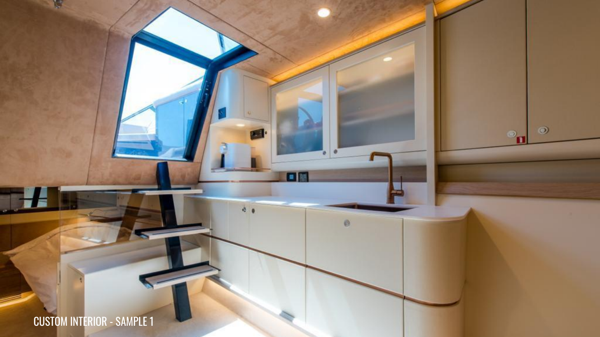
CUSTOM INTERIOR - SAMPLE 1